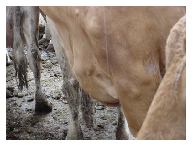
Fig. 1. Granuloma induced by a killed, oil-adjuvanted Johne's disease vaccine.

Accidental inoculation of humans with JD vaccines may also cause a granulomatous lesion at the injection site.<sup>5,6</sup> The severity of lesions may depend on the amount of vaccine injected and the amount of trauma to the injection site. In the event of an accidental inoculation, veterinarians are advised to contact their health care provider and state public health office immediately for specific treatment recommendations.